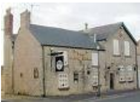
The Blue Bell Bolsover